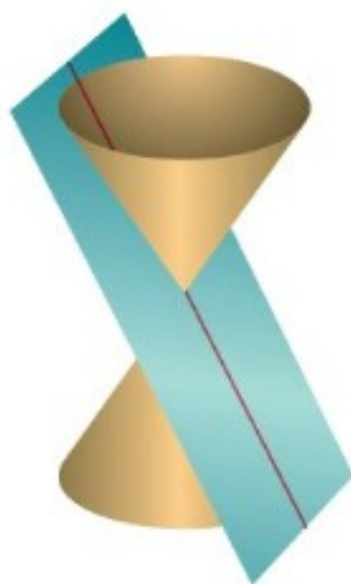
Single line: plane tangent to cone