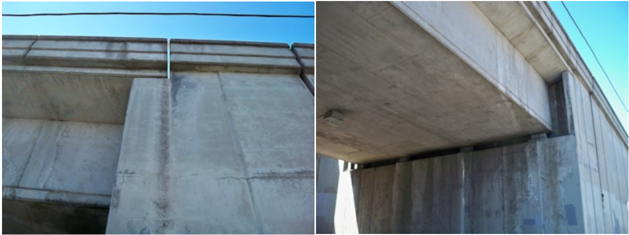
Exit lane from Freeway to Lincoln St