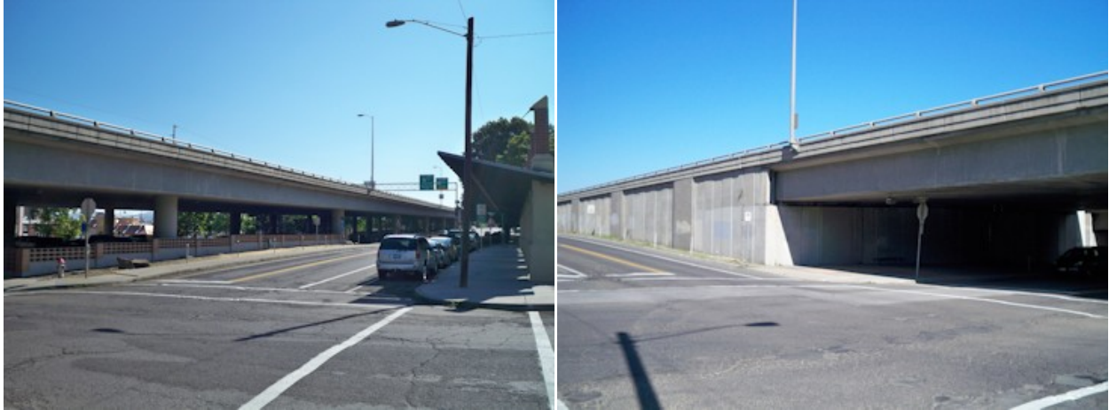
Corner of Wall St. & 4th